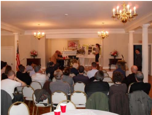
Attendees at the Student Design Awards