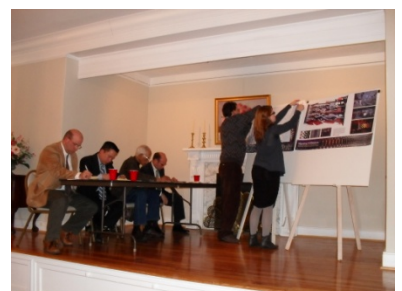
Setting up each presentation